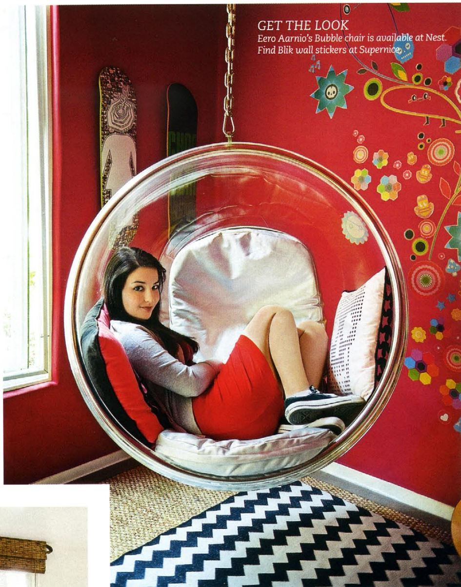
GET THE LOOK Eero Aarnio's Bubble chair is available at Nest. Find Blik wall stickers at Supernice.

Biggest myth about LA? That it has no style.