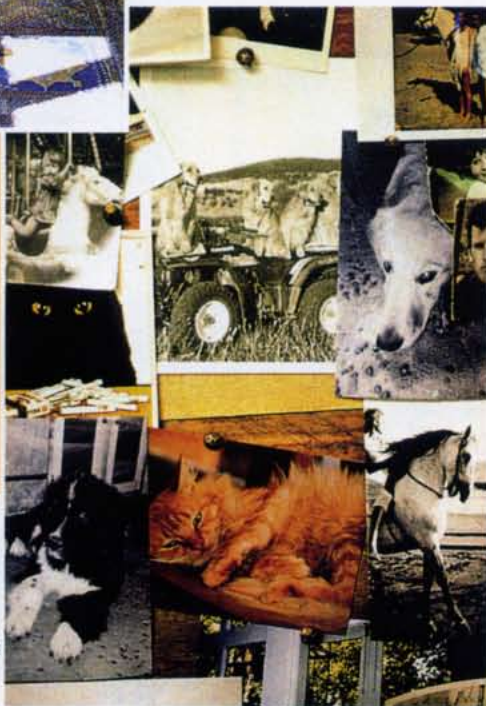
PET-PACKED (CLOCKWISE FROM ABOVE LEFT): DINING-ROOM DOVES; TACKED-UP PHOTOS OF THE COUPLE'S LIVE-IN MENAGERIE; TATJANA IN THE LIGHT-FILLED LIVING ROOM WITH A PILEUP OF PUPPY LOVE AT HER FEET.